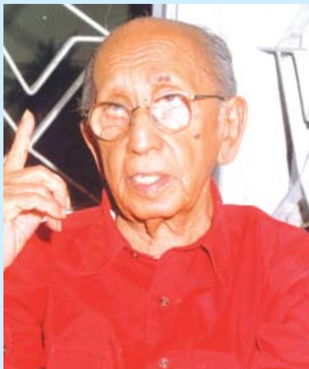
Lester James Pieris